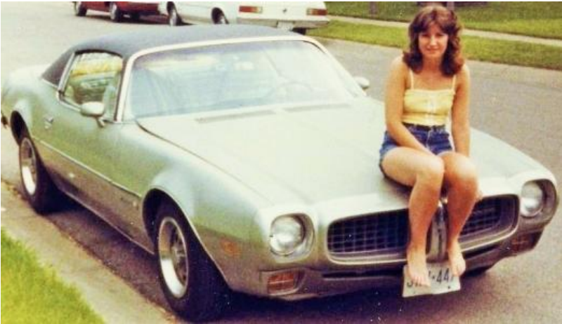
My First Car - A Firebird

I went to Andrew Jackson high school in St. Louis, during the years 1957-1961. Our school was of average size back then, with about 400 total students. Our mascot was the Cougar, and our school colors were gold and red. We were actually able to borrow a real cougar from time-to-time for special school events (along with his handler from the St. Louis Zoo). One time the cougar - - - (example answer).