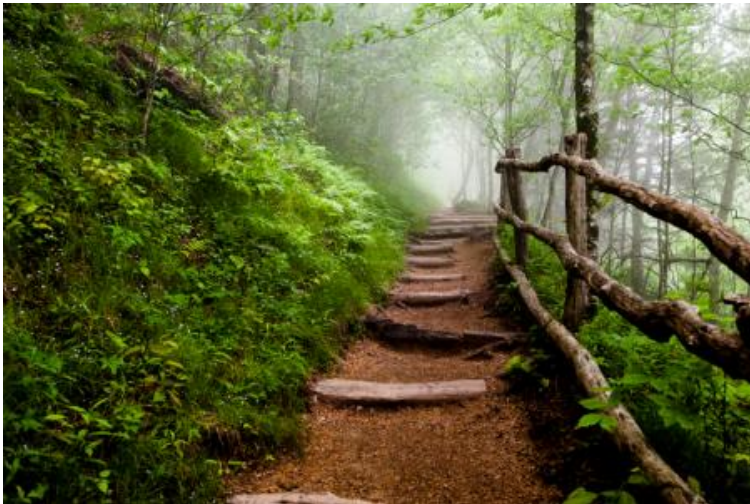
Where We Would Walk - Charlie's Bunion

I didn't date a whole lot back then, but when I did go out we would often go to dinner and then go see a movie. Although I really enjoyed going to the movies, I also found it awkward to do on the first or second date, because I usually did not know the guy well, and we would sit closely in the dark together without speaking! I liked the dates best that involved going to dinner, and going for a walk so that we could talk and - - - (example answer).