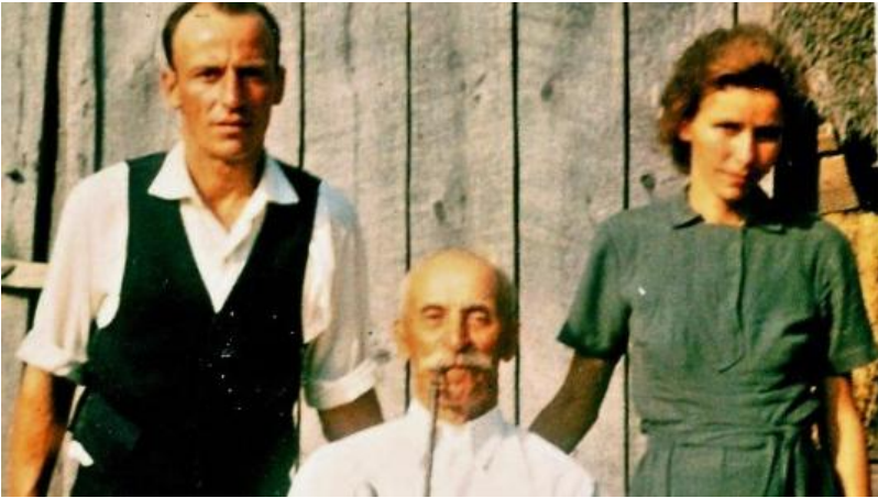
My Father, Grandfather, and Mother - Back in The Old Country

I know that my father's family name is Johnstone and that his family came over from England. I think he said that they originally came over from the Northern area. My mother's family name is McDermott and I know that her family came from a large and well-known clan of McDermott's living in the central Scotland area. The McDermott name itself is derived from an old phrase my grandmother used to always say - - - (example answer).