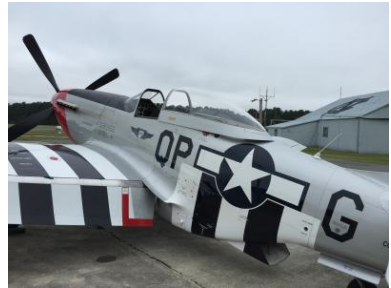
A P-51 Fighter

My MOS (Military Occupational Specialty) in the Army was 15 Quebec (Q) – Air Traffic Control Operator. I had always had an interest in aviation, and that Army occupation was in high demand back then, because of Vietnam, so I signed up for it. The training for Controller was much more difficult than I thought! I had no idea that I would have to actually monitor and manage so many - - - (example answer).