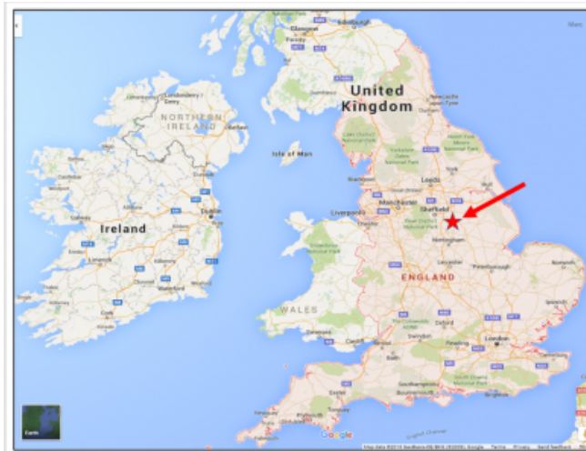
Where We Are From

I know that my mother came from Dundee, Scotland, and that her family were sheep herders over there. My father's family came from a small town just South of Heidelberg, Germany, and I believe most of them worked as farmers and woodcutters. Mom told me that her family decided to come over to America early in the 1920s because - - - (example answer).