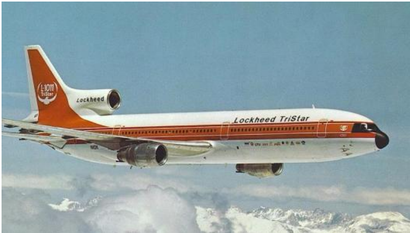
My Darling: The L-1011

M y very first job was as a golf caddy at a private golf club... and I hated it. For some reason my parents thought that it would be a great first job, but it was actually really miserable for me. I did not know a thing about golf (back then), it was extremely hard work (especially for a 12 year old kid), and the pay was totally crap! I usually only received about $4.00 for spending 4 HOURS on the golf course, hauling around a huge, heavy bag of - - - (example answer)