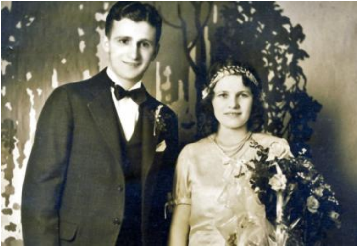
My Parents at Their Wedding

I had a grandfather in Bitburgh, Germany that was well known there, because he was actually the mayor of the town! Unfortunately a beer tax scandal was uncovered during his last term (which he was not involved with of course) and my grandfather became rather unpopular. I heard that he was practically run out of town. He came over to the United States himself a few years later - - - (example answer).