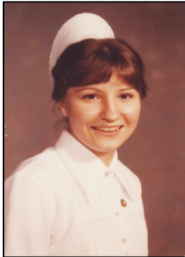
Me in Nursing School